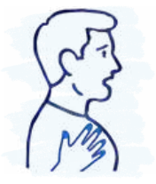
Lips/fingernails turning blue/grey